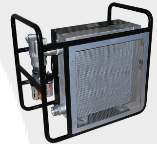
Air after-cooler, to increase Jetting performances when ambient temperature is over 20°C