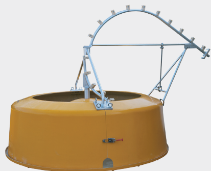
Figaro / Figarino, intermediate cable storage system, avoiding figure of 8