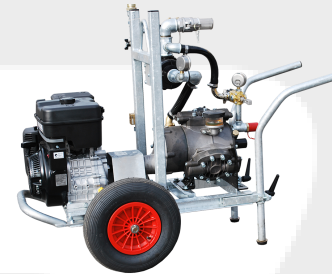
Hydrocab-080, accessory for cable installation with water (floating), 80 l/min

Specifications are subject to change without notice