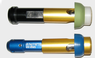
Sonic head, for the installation of cables with low stiffness