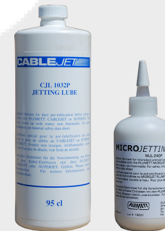
Jetting Lube / Micro Jetting Lube, lubricant improving Jetting performance